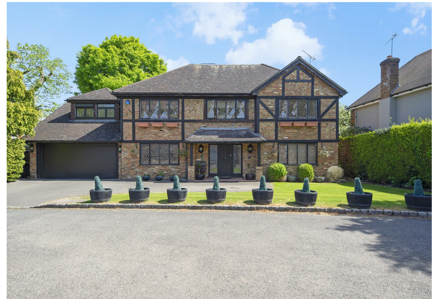
5 Greenoak Way, Wimbledon Village, SW19 5EN